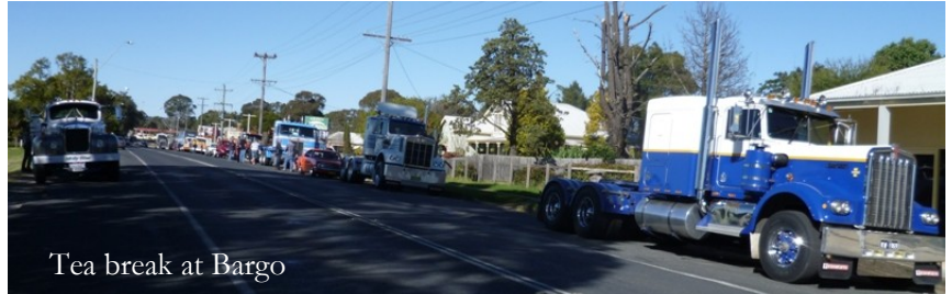
Tea break at Bargo