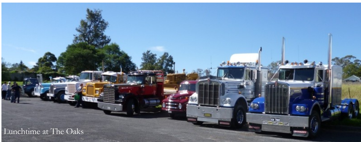
Lunchtime at The Oaks